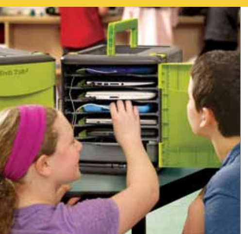
6 devices Tech Tub<sup>2</sup>° - holds iPads°, Chromebooks™ and other tablets (FTT700)